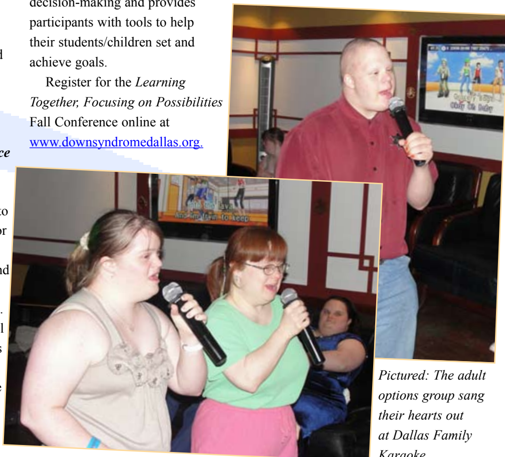
Pictured: The adult options group sang their hearts out at Dallas Family Karaoke.