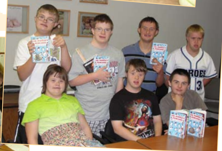
Bottom: The DSG teen book club enjoyed reading Mr. Popper's Penguins this summer.