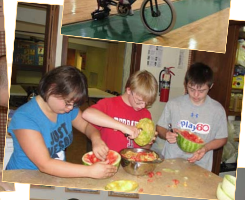
Middle: DSG teens cooked up a healthy dinner and lots of fun.