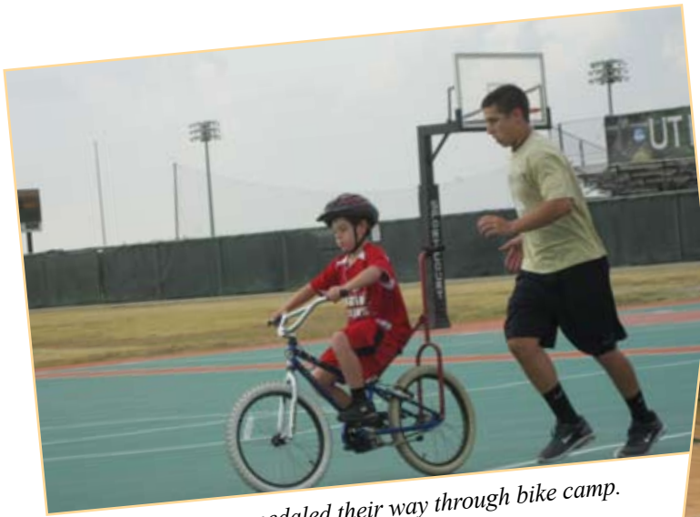
Top: Campers pedaled their way through bike camp.